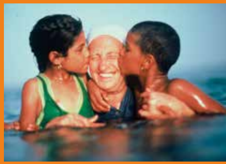
Sister Emmanuelle with two young rag-and-bone collectors in the Suez canal (Egypt)

10-31-1087 / Certifié PEFC / Ce produit est issu de forêts gérées durablement et de sources contrôlées. / pefc-france.org