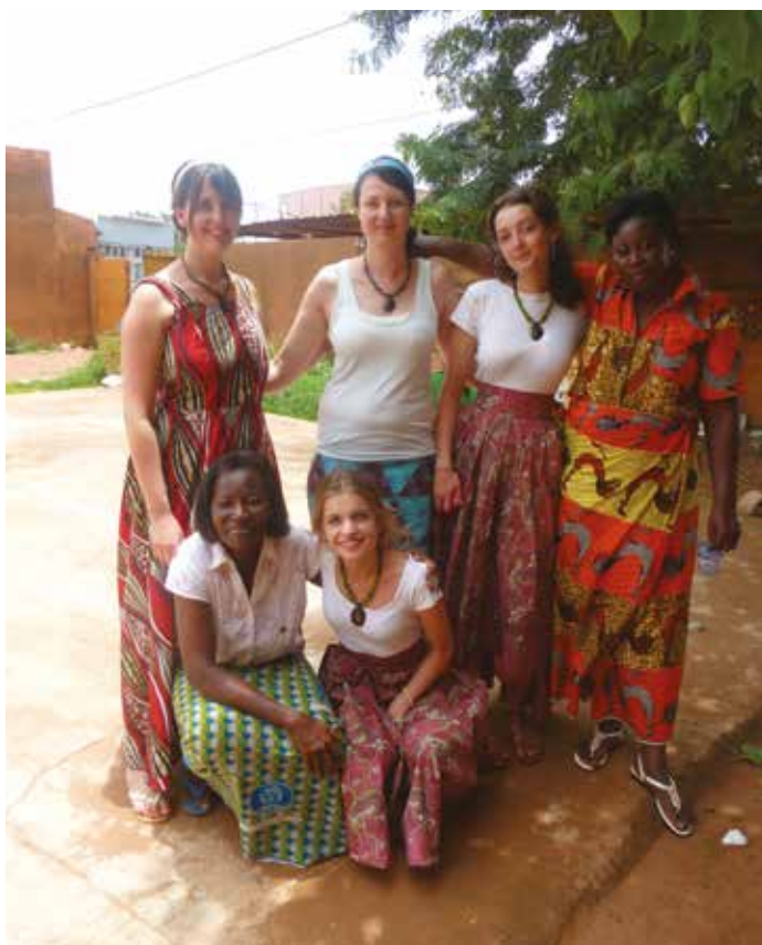
The four volunteers with the EJA team

“Everything that we learned through this site is being passed on to the other children at the school who did not take part. Some of the activities are being included in the school curricula so that all the classes can take advantage of them (games, decoration, making things, etc.)”