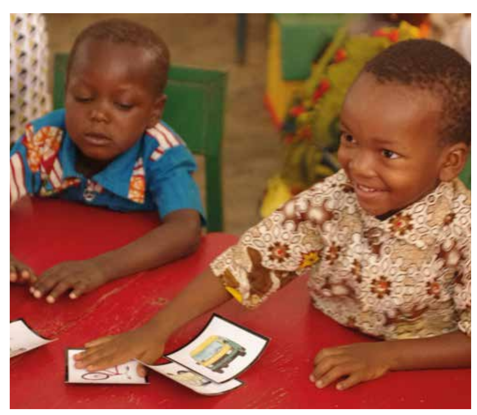
The picture book helps children to develop their imagination and their language. A child who reads is a happy child.

85% of second- to fifth-year primary teachers are using more participatory teaching methods by the end of the trial