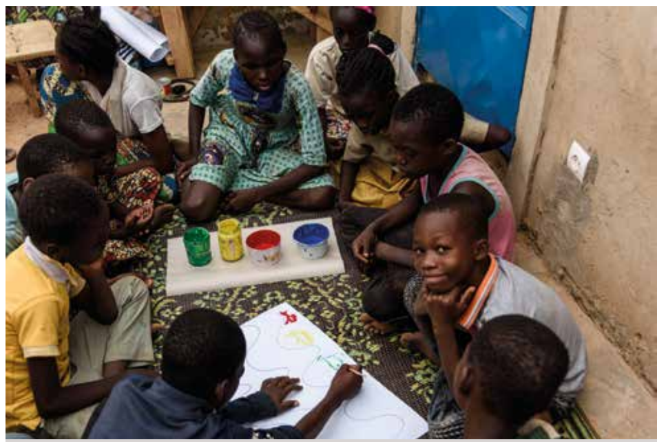
A family's yard transformed into a classroom for children from the Cissin neighbourhood in Ouagadougou (very poor district of the city). A large majority of children in Burkina Faso do not have access to preschool education, which forms the basis for all learning.