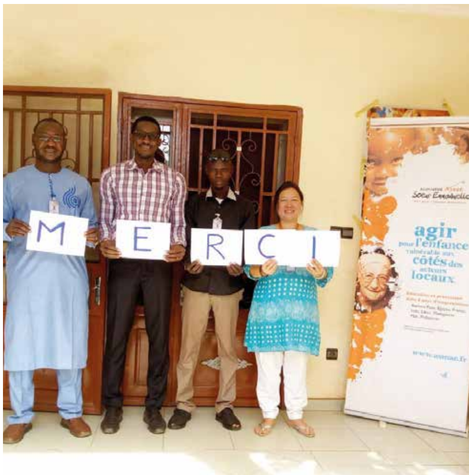
In Burkina Faso on Giving Tuesday.