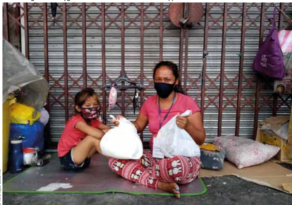
Distributing food and hygiene kits to street families in the Philippines.

Asmae and its local partners have created numerous actions adapted to the situation in each country – distributing food, hygiene kits and masks. A response is provided for each group of the population. As a result of all these actions, we have been able to help 1,500 families with priority emergency operations. In Madagascar, for example, where many people do not have running water, jerry cans with taps have been distributed to guarantee a minimum store of water per family and to allow them to wash their hands several times a day. Another important action has been awareness campaigns aimed at families on how to prevent transmission. Distance learning programmes are also being run so that education is not interrupted. In the Philippines, it has been possible to house homeless families who have expressed a need for shelter, despite the fears of landlords, who are not accepting new tenants because of the fear of infection.