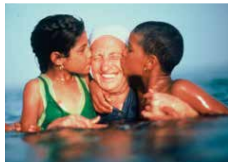
Sister Emmanuelle with two young ragpickers in the Suez Canal (Egypt).