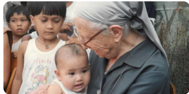
Sister Emmanuelle surrounded by children in the Philippines.

For 43 years now, Asmae has been continuing the work of our founder, always staying true to her principles.