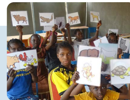
Beneficiaries of the project using the Yam Wekre tool.

Asmae would like to thank our partners who have contributed to funding this project: AFD, the Monégasque International Cooperation Department (DCI) and the Société Générale Foundation.