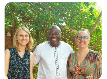
The Asmae team and the Mayor of Korhogo during their visit.

*Young people within the Côte d'Ivoire jobs market. A ticking time bomb about to go off? CAIRN **Multiple Indicator Cluster Survey 5, UNICEF