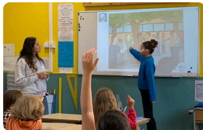
Raising awareness of the dangers of bullying.

95% of teachers surveyed said they believe the sessions have helped pupils better understand what bullying is and its consequences. One teacher at a school in Nantes testified that "the intervention clarifies what bullying really is and its devastating effects, furthermore, it sheds light on the punishments it can lead to" . The methods used are interactive, including theatre performances and roleplays, "which promotes discussions on the topic and allows victims to speak out. It's a significant preventive opportunity, giving the pupils a real voice" , explains a teacher from Mans.